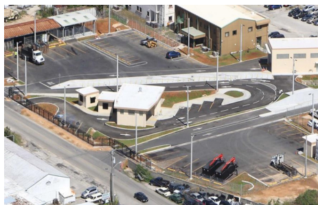
Photo of Harmon Residential Solid Waste Transfer Station and Household Hazardous Waste Facility.

The Harmon Residential Solid Waste Transfer Station is the closest operating transfer station. It is located on Harmon Industrial Road behind the Department of Public Works complex. The Harmon transfer station also accepts household hazardous waste from residents without charge.